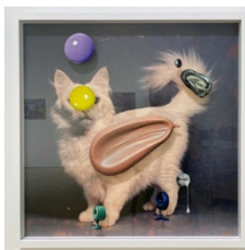
Teppei Kaneuji Sea and Pus (Photograph of Cat) #3 , 2022 UV inkjet print (StareReap 2.5 print) on acrylic board, polycarbonate 18 x 18 inches Edition 3/7 + 2 AP (14430)