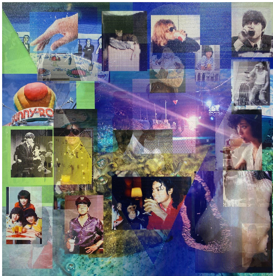
CMTK (Chihiro Mori x Teppei Kaneuji), Star & Dust (New York/Non-Alcoholic) , 2022. Lenticular film on acrylic panel. 20 x 20 inches.