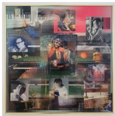
CMTK (Chihiro Mori x Teppei Kaneuji) Star & Dust (New York/Alcoholic) , 2022 lenticular film on acrylic panel 20 x 20 inches (14431)