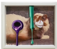
Teppei Kaneuji Sea and Pus (Photograph of Cat) #8 , 2022 UV inkjet print (StareReap 2.5 print) on acrylic board, polycarbonate 10 x 12 inches Edition 3/7 + 2 AP (14429)