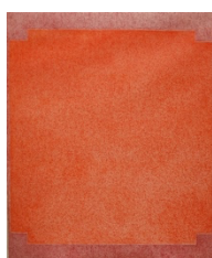
Howard Smith Red within Red , 2023 oil on linen 36 x 30 in (14756)