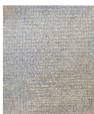
Howard Smith Payne's Gray with yellow , ca. 2018 oil on canvas 20 x 16 in (14753)