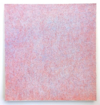
Howard Smith Flamingo , 2010 oil on canvas 30 x 28 in (13218)