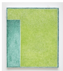
Howard Smith On CGLV , 2020 Oil on linen 17.25 x 15 in (14201)