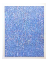
Howard Smith Blues, pink, yellow , 2015 oil on linen 28.5 x 22 in (13217)