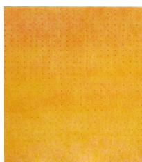
Howard Smith Reds within Yellow over Orange , 2023 oil on linen 32 x 30 in (14757)