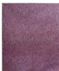
Howard Smith Cobalt Violet Dark, #8 , 2023 oil on canvas 24 x 20 in (14755)