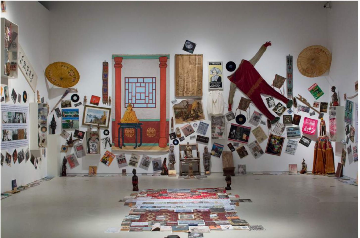
Georges Adéagbo, The revolution and the revolutions...I , 2016, found objects, artifacts, texts, paintings, magazines, installation view.

A case can be made that the Shanghai Biennale, widely regarded as a perfunctory affair, too disorganized and lackluster to justify its existence, now has the potential to intelligently introduce international contemporary art into a scene until recently dominated by Chinese art. And this year, that goal seems within reach, under the curatorial stewardship of Raqs Media Collective, three artists from India, who brought with them a host of Southeast Asian artists. Some 92 artists from 40 countries fill the cavernous galleries of the Power Station of Art, a reconfigured structure that opened as an art museum in 2012. The venue is a vast improvement over the biennale's former locale—the old Shanghai Museum of Art, located in a colonialist building that was once the racecourse-clubhouse. Given its vastness, the challenge for curators was to fill the space without overwhelming and confusing viewers.