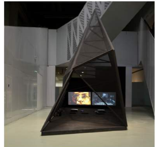
Moinak Biswas, Across the Burning Track , 2016, two-channel video, installation view.