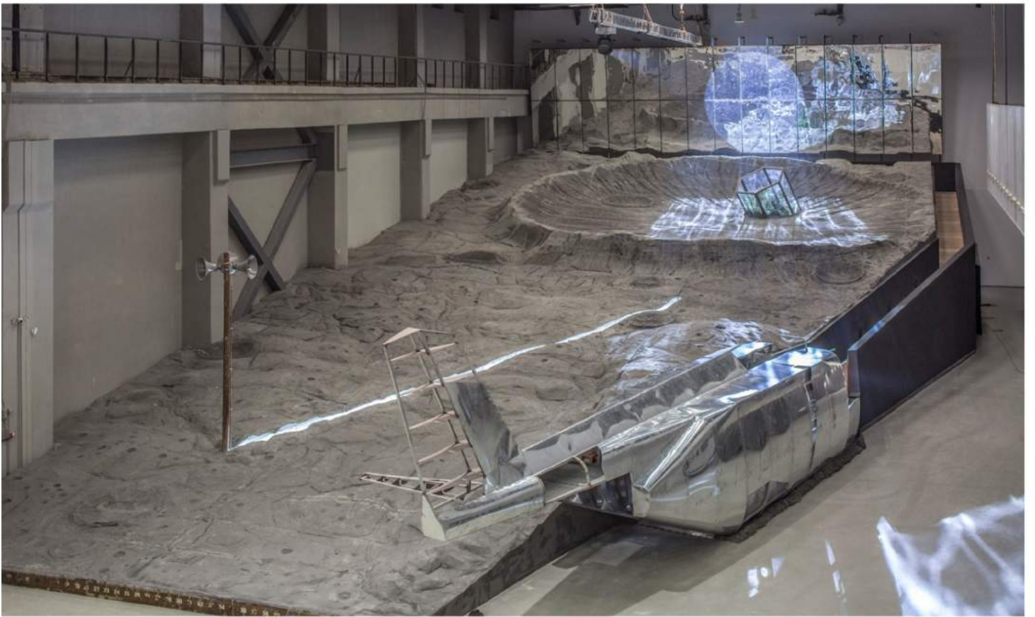
MouSen+MSG, The Great Chain of Being — Planet Trilogy , 2016, experimental theatre space, videos, sound, objects, and bees, installation view.

Copyright 2017, Art Media ARTNEWS, llc. 110 Greene Street, 2nd Fl., New York, N.Y. 10012. All rights reserved.