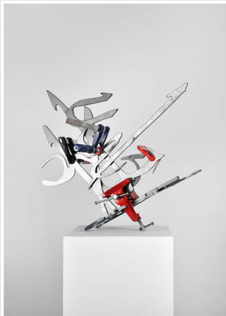
Mounir Fatmi, 'Calligraphy of Fire', 2012, steel calligraphies and clamps, 42 x 48 x 48 cm.

Words hold an incredibly high value to Fatmi, who once pledged to never label a finished work as simply "untitled". Although Fatmi utilises both English and French in his work, hyper-stylised Arabic script occurs in some of Fatmi's most visually lush work. One of his most well-known installations is Modern Times: A History of the Machine , in which Marcel Duchamp's Rotoreliefs appear with rotating gear-like religious verses overlaying architectural drawings of Middle Eastern monuments, a contemplation on contemporary architecture and the "sense of a futile and hypnotic machine".