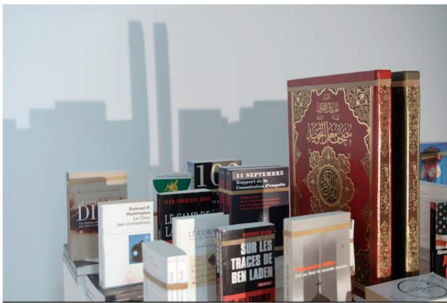
Mounir Fatmi, 'Save Manhattan 01', 2004, table, books published after Sept. 11th, 2001, strings and spotlight, around 150 x 90 cm.

To create a façade, Fatmi employs everyday objects to construct a visual landscape and “fragile architecture”. In his “Save Manhattan” series of installations, Fatmi uses copies of the Qur’an ( Save Manhattan 01 ) and a pair of stereo speakers ( Save Manhattan 03 ) to represent the Twin Towers found in New York City before 9/11, along with actual sounds recorded in the famous metropolis. In another installation, VHS tapes construct a slick, black room with an electric chair (like Andy Warhol’s Big Electric Chair ) gleaming inside. Books, speakers and tapes allude to the training and propaganda that can be cheaply reproduced and quickly introduced to others across borders, ethnicities and cultures.