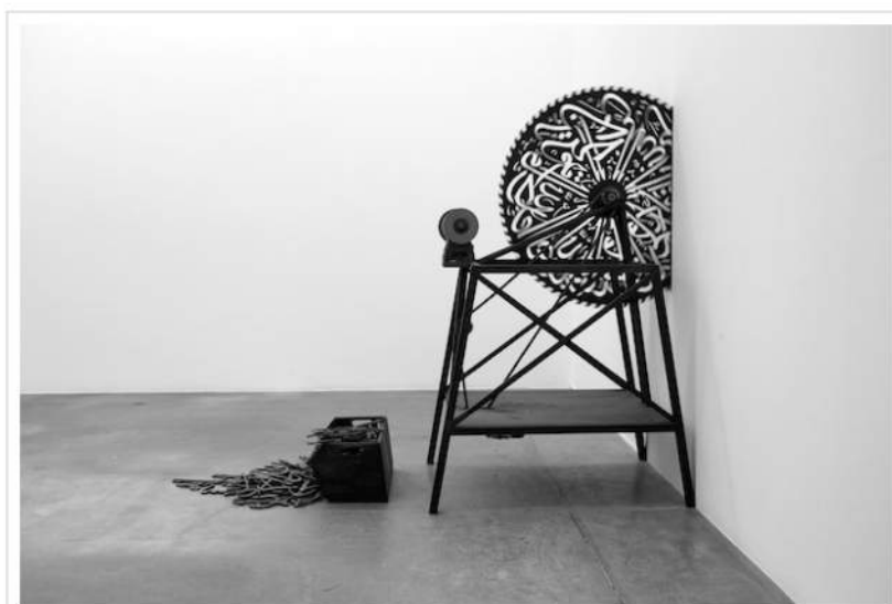
Mounir Fatmi, 'The Paradox', 2014, machine in steel, arabic calligraphy, and engine, 75 x 100 x 116 cm.

I emphasise again the question of illusion, by offering the public cocktails in which I blend the spiritual and the spirits: iced holy water in alcohol. The experience asks the audience to judge a work of art that is consumed. The more one consumes the alcohol, the more the alcohol goes to the brain and the less one is able to judge the work.