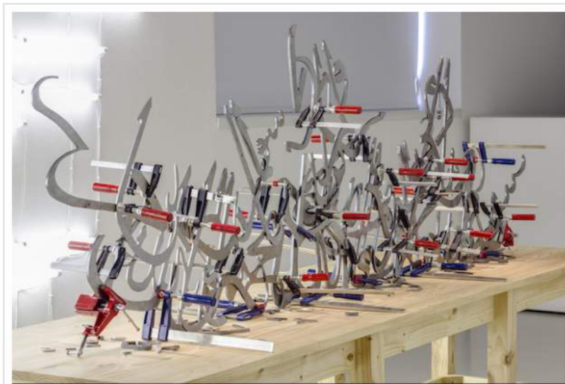
Mounir Fatmi, 'Calligraphy of Fire, Tribute to Brion Gysin', 2012, steel, clamps, and table, 120 x 160 cm.

I started thinking about calligraphy and its use after discovering the work of Brion Gysin in Tangier. His insight of calligraphy does not stop just with beauty and aesthetics, but is also about the deconstruction of language.