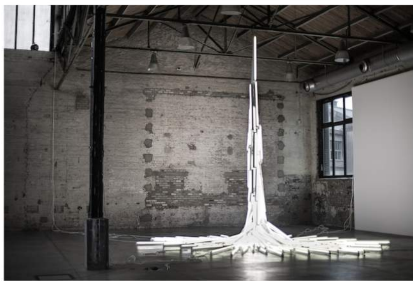
Mounir Fatmi, 'In the Absence of Evidence to the Contrary 03', 2012, luminescent tubes, size may vary.

Due to Fatmi's intimate experience with consumerism, much of his work builds upon obsolete or soon-to-be retired products reappropriated in surprising ways. In Fatmi's In the Absence of Evidence to the Contrary installation, the audience must lean into the installation, in order to read the small Arabic and English text on each fluorescent tube. The image of the text is then imprinted on the viewer's sight for a brief duration, blurring the line between illusion and reality. In Fatmi's capable hands, coaxial cables, copier machines, fluorescent tubes and VHS tapes become fodder for the idea of the demise of a consumed product but can also reference censorship in the surveillance state and the "transfer of images and information".