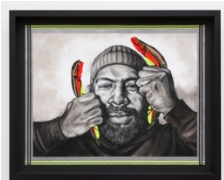
Sydney G. James Bereavement? (masculine) , 2023 Charcoal, workmen shirts, safety vest, duct tape, reflective fabric trim, and gel medium on watercolor paper 40.5 x 50.5 inches, framed (34 x 44 inches unframed) (14702)