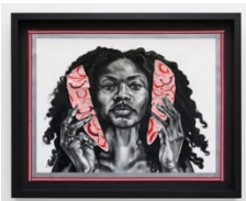
Sydney G. James Bereavement? (feminine) , 2023 Charcoal, non-medical masks, tape, reflective fabric trim and acrylic on watercolor paper 40.5 x 50.5 inches, framed (34 x 44 inches unframed) (14701)