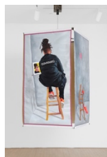
Sydney G. James Implicit Bias Training , 2023 Acrylic on canvas, metal frame, motor 89 x 51 x 51 inches (4 canvases, 89 x 48 inches each) (14698)