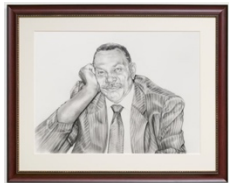
Sydney G. James Gerald, 2023 Graphite on watercolor paper 32 x 40 inches, framed (14704)