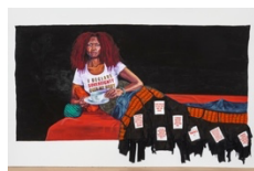
Sydney G. James Serving Tee Liberation , 2023 Acrylic, t-shirts, fabric, and gel medium on canvas 113 x 191 inches (14699)