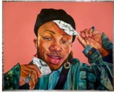
Sydney G. James Bereavement? (non-binary), 2023 Acrylic, fabric, gel medium, and satin trim on canvas 84 x 104 inches (14700)