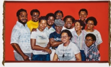
Sydney G. James The Westside Johnsons, 2022 Acrylic, gel medium, and upholstery trim on canvas 72 x 121 inches (14703)